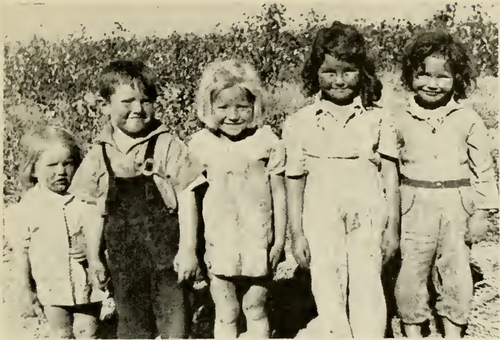
A week at Sunny Acres means good times and smiles like these

spirit. Sometimes the processes go hand in hand to the great advantage of both. Certainly when reports come in indicating a liberation from ingrown selfishness and a growth in Christian spirit of concern for and thoughtfulness of others, we find ourselves touched by a profound conviction that God is working with us and that our labors are not in vain. Excerpts from two reports help make this point more vivid.